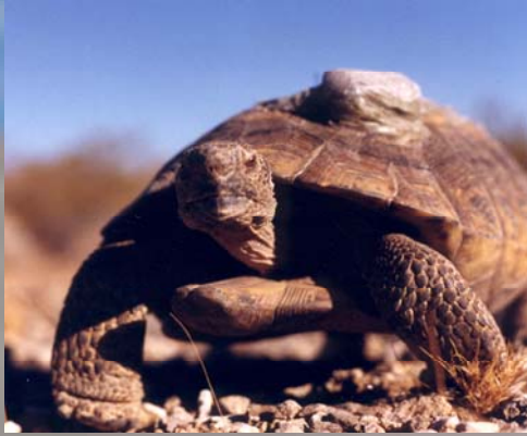
Kristen Murphy, 1997

In addition to the Big Dune beetles, elevations below 5,000 feet in Southern Nevada are home to the largest living reptile in the arid southwest – the desert tortoise.